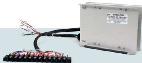
1881 Card Cage and Harness

The 1881 Card Cage provides all the necessary hardware and harnessing required to allow the simple wiring of the 3140 card to the detector outputs and controller inputs. The 1881 is equipped with two 60" long cables which are wired to the controller. The first cable carries all 115 VAC power wiring, safety ground, and card outputs. The second cable is terminated to a 12 point terminal block which is typically mounted in the wiring compartment of the cabinet. The detectors are then connected to the terminal block.